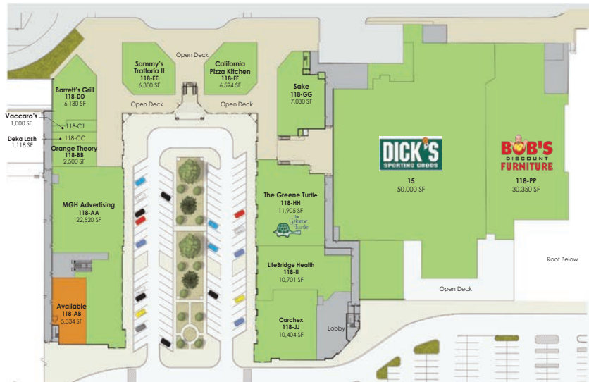
LEASE PLAN UPPER FLOOR Scale: 1" = 40'