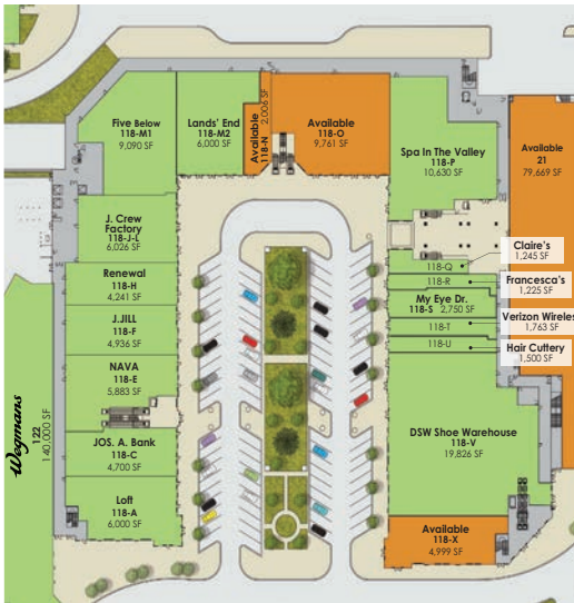
LEASE PLAN GROUND FLOOR Scale: 1" = 40'